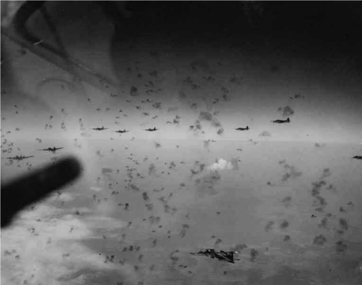
Mission to Merseburg

war. The Eighth Air Force adventure is one of the best documented of any unit in any war. Those who were there are fast disappearing. I take my hat off to the guys who flew missions in the early stages and suffered accordingly. I never forget the competent and devoted ground personnel who performed so admirably. When their plane failed to return they suffered and you could see and feel their grief.