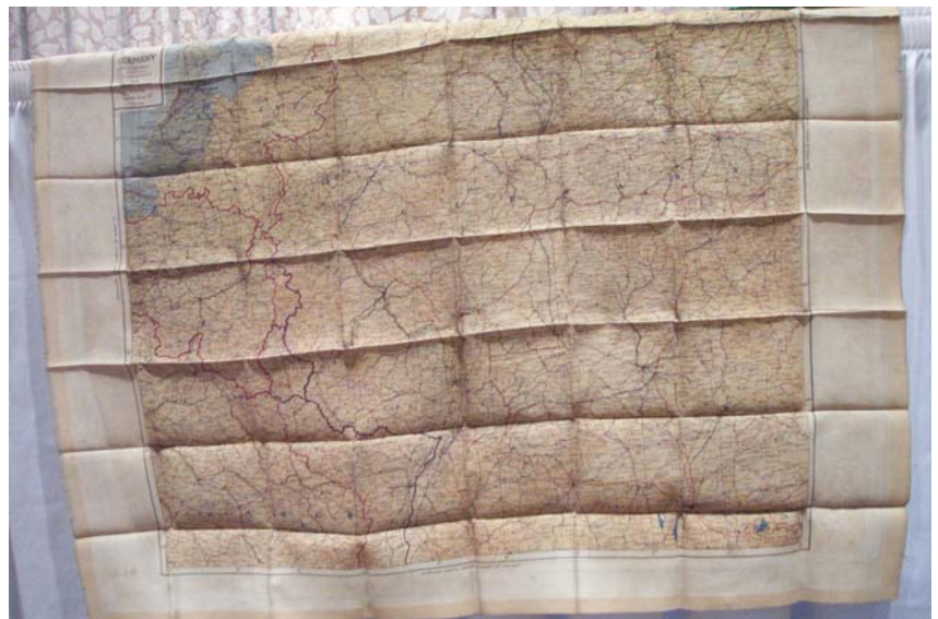
Ken Rowe's Escape Map