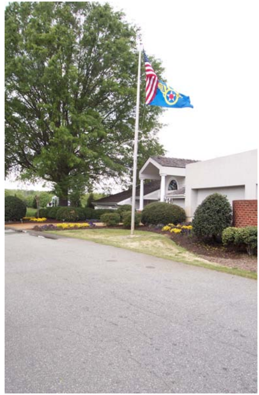
Our Flags were flying at Stonehenge!